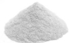
Mag Hydrogen (Powder : 3~80μm)