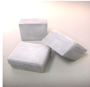
Mag Hydrogen (Tablet)