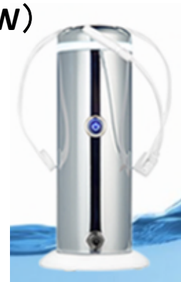
Hydrogen gas suction